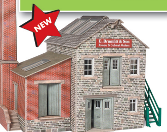
RAMSHACKLE WORKSHOP 00 SCALE PO286 / N SCALE PN186

CREATE YOUR OWN VERTICAL TOWN USING A VARIETY OF BEAUTIFUL METCALFE BUILDINGS, AS USED IN THE DIORAMA ABOVE.